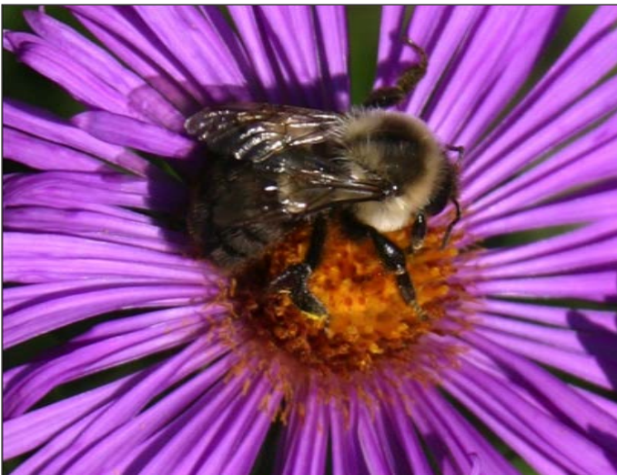
Bumble bee visits aster flower for pollen and nectar.

Gardeners are increasingly concerned about the status of pollinators in Ohio. Important pollinators such as honey bees, bumble bees and monarch butterflies have gained attention in recent years due to concerns about declining populations. Pollinators are vital to the production of many food crops and provide a service essential to the survival of many native plants. Fortunately, gardeners can take steps to support these and other pollinators through plant selection and simple gardening practices. This fact sheet describes the importance of pollinators, their role in the ecosystem, and actions gardeners can take to help pollinator populations in their yards and gardens.