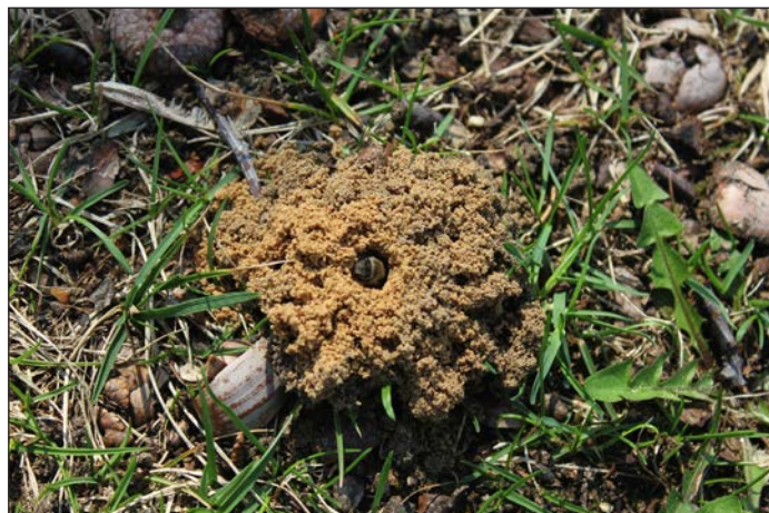
Native mining bees frequently nest in sandy soils on south-facing slopes.

Animal pollinators and bees in particular are currently facing many threats, such as lack of forage (flowers for food), pests, pathogens, pesticides, invasive plants, climate change and lack of suitable nesting sites. Gardeners can play an important role in pollinator conservation by providing plants and nesting sites for pollinators and by adapting gardening practices to protect pollinators.