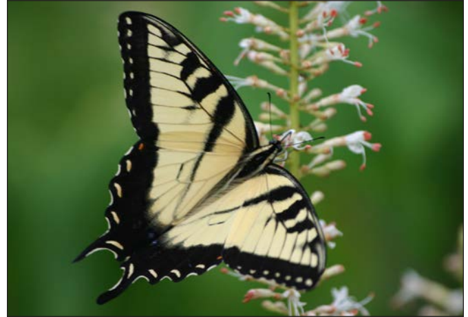
Swallowtail butterfly drinks nectar from bottlebrush buckeye flowers.

depend on repeat visits by pollinators, so many offer small rewards repeated at regular intervals to encourage return trips.