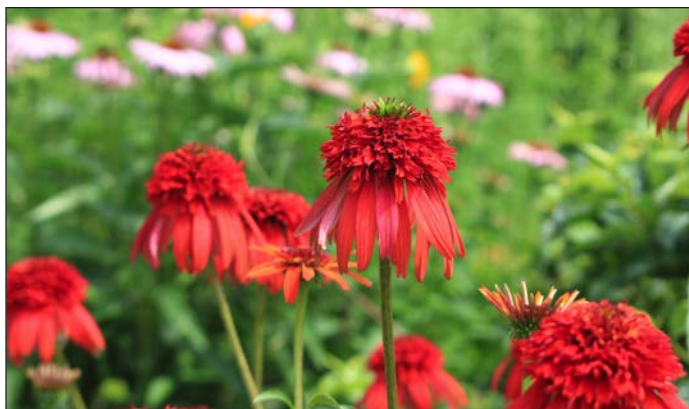
Some cultivars with complex petal arrangements and unusual colors are less attractive to pollinators, such as this 'Hot Papaya' purple coneflower.

Some cultivars and hybrids don't offer the pollen and nectar rewards that so-called "straight species" do, since the quality and quantity of nectar and pollen are sometimes lost during breeding. Plants bred with "double" flower petals are often inaccessible to pollinators. Gardeners can include less refined plants along with plant cultivars to offer broad pollinator appeal.