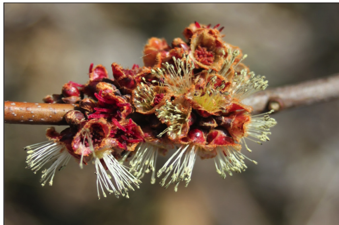
Early-blooming maples provide an important pollen and nectar source for bees in early spring.

Gardeners can help pollinators by planting flowers with a sequence of bloom throughout the growing season, from early spring through late fall. Early-blooming