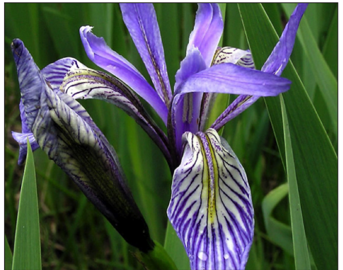
Lines and coloration on petals help pollinators quickly find rewards.

Flowers use a variety of strategies to attract pollinators, including petal color, scent, UV light patterns and nectar guides. Bees in particular use floral qualities such