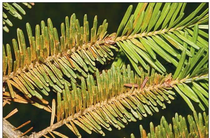
Spruce spider mite damage on fir needles.