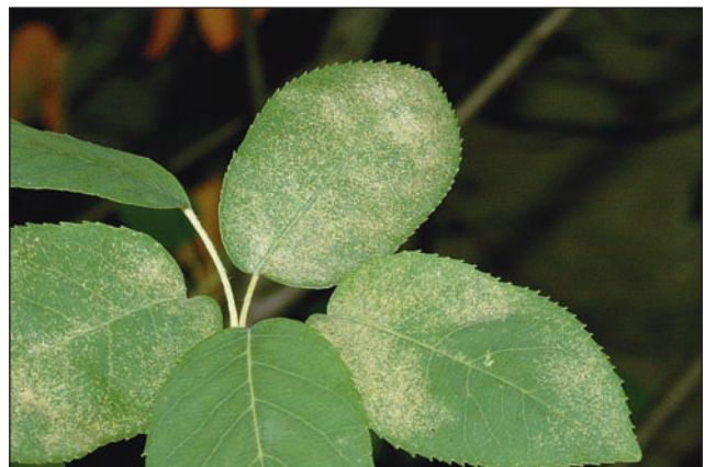
European red mite damage on serviceberry leaves.

Heavily infested plants may be discolored, stunted, or even killed. Web-producing spider mites may coat the foliage with the fine silk, which collects dust and looks dirty.