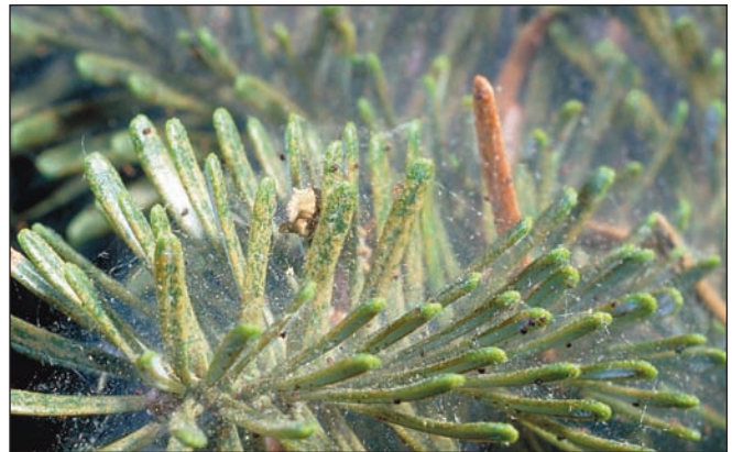
Spruce spider mite damage; webbing and mites on fir.

This mite spends the winter in the egg stage attached to small branches. The eggs hatch in March through April