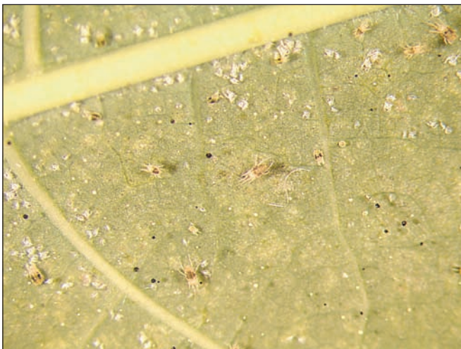
Twospotted spider mite stages on underside of leaf.