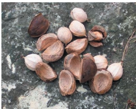
Figure 1. Shagbark hickory nuts—A common hard mast found in Ohio forests.

Mast is often categorized as either soft or hard. Hard mast consists of hard shelled seeds that have a relatively long “shelf life” and are typically high in fat, carbohydrates, and protein. These characteristics make