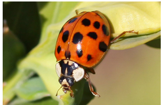
Figure 1. Multicolored Asian lady beetle adult.

understood, MALB populations began to decline in the mid-2000s with numbers receding to such an extent that the beetles were seldom a problem in and around homes by 2007. However, in 2013, MALB populations began to rebound in Ohio with numerous localized reports of large numbers of beetles entering homes, particularly in the southern part of the state.