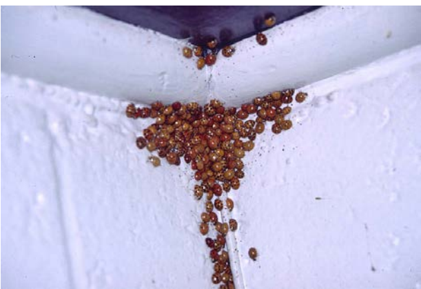
Figure 6. Multicolored Asian lady beetle cluster in a home.

In their native habitat, large MALB aggregations often hibernate (overwinter) in cracks and crevices within rock cliff faces. Indeed, studies have shown that MALB is attracted to surfaces covered in highly contrasting vertical black and white stripes (4). Unfortunately, in North America, these foreign lady beetles sometime mistake the outside walls of buildings for rock cliffs causing them to seek overwintering sites in and around buildings.