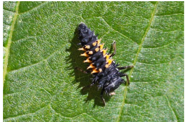
Figure 3. Multicolored Asian lady beetle larva.

The larva eventually molts into a pupa (Figure 4), which is about the same size as the adult beetle and resembles an orangish-red pill firmly attached to plants, often on the underside of leaves. The pupae have distinct segments and two parallel, longitudinal rows of black spots. MALB spends around 5 to 6 days in the pupal stage.