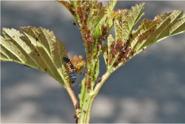
Figure 5. Multicolored Asian lady beetle larva eating aphids.

winter as adults congregated in protected locations. When one lady beetle lands, many others soon follow. Studies conducted on MALB as well as other lady beetles have shown that this aggregation behavior involves temperature, visual and chemical cues (2).