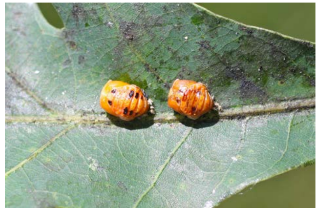
Figure 4. Multicolored Asian lady beetle pupae.