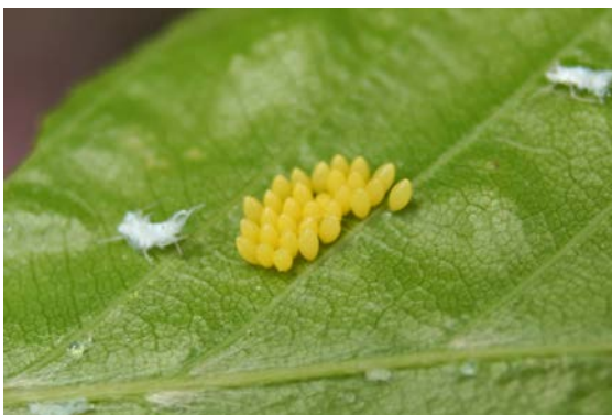
Figure 2. Multicolored Asian lady beetle eggs.

The adults emerge from their protected overwintering sites in the spring to lay eggs (Figure 2). The oval shaped eggs are yellow and typically laid in clusters of about 20 on the underside of leaves or on twigs. Egg clusters are often found deposited in and around high populations of aphids and other soft-bodied insects, which are favorite foods of MALB. Eggs hatch in 3 to 5 days.