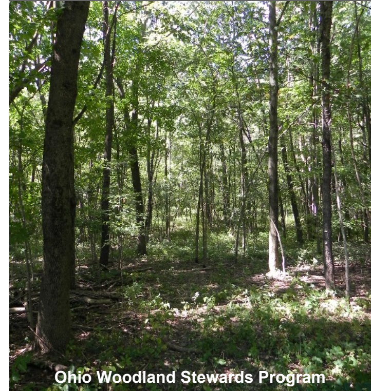
Ohio Woodland Stewards Program