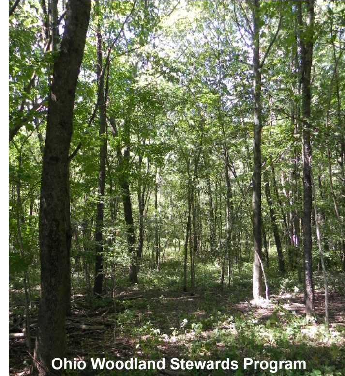
Ohio Woodland Stewards Program