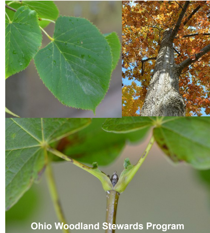
Ohio Woodland Stewards Program